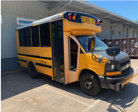
Buses we are purchasing from DATTCO, Inc in New Britain, CT